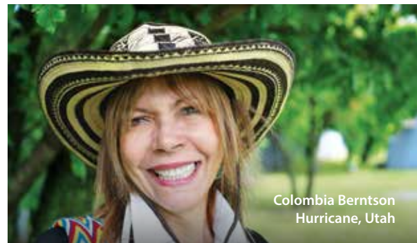
Colombia Berntson Hurricane, Utah