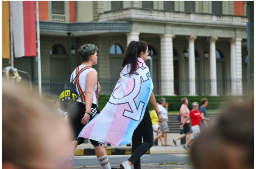
Activists at an LGBTQI+ Pride Parade in Geneva

The International Criminal Investigative Training Assistance Program (ICITAP) delivered webinars worldwide to promote racial justice, inclusion, and police reform. In September, ICITAP-trained Ukrainian police officers ensured the peaceful assembly of thousands of participants at the annual Equality March in Kyiv, Ukraine. During FY21, in the Dominican Republic, ICITAP delivered training and mentoring to the Dominican National Police Directorate for Attention to Women and Domestic Violence to strengthen police relations with the LGBTQI+ community.