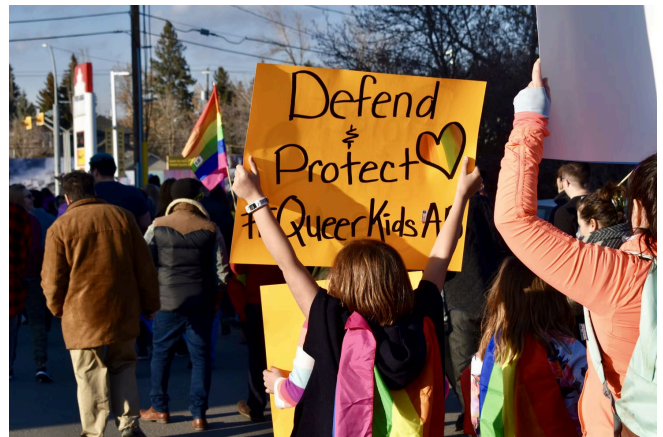
Activists at a Gay-Straight Alliance march in Calgary, Canada (March 29, 2019)

ITA is supporting the LGBTQI+ community within its Foreign Service Officer corps through participation in the State Department's interagency Same Sex Spouse Accreditation Working Group. This group is working to collect and share with the LGBTQI+ Officer corps the best available information about host country laws and attitudes toward the LGBTQI+ community, with the goal of informing those Officers' decisions about choosing country assignments.