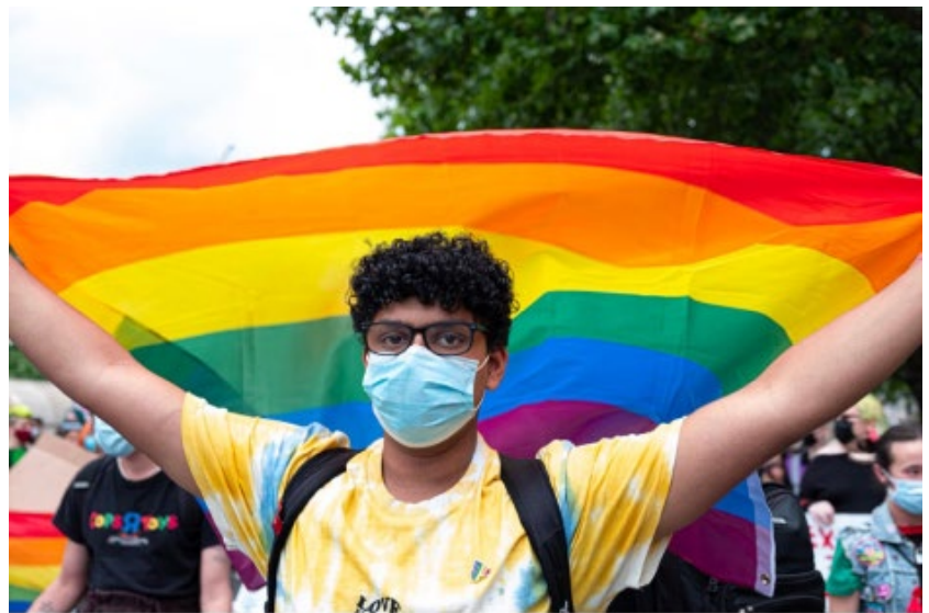
Activist at a Trans Rights Protest in London, Soho

Since the issuance of the Presidential Memorandum on Advancing the Human Rights of LGBTQI+ Persons around the World, ILAB has created mechanisms to coordinate implementation of Administration mandates, including on LGBTQI+ rights; increased staff capacity on LGBTQI+ rights in the labor and employment sphere through trainings and engagement with international organizations and civil society; strengthened coordination with civil society organizations and international organizations to identify gaps in efforts